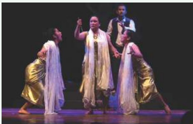
(Photograph of play ‘Tirkha’)