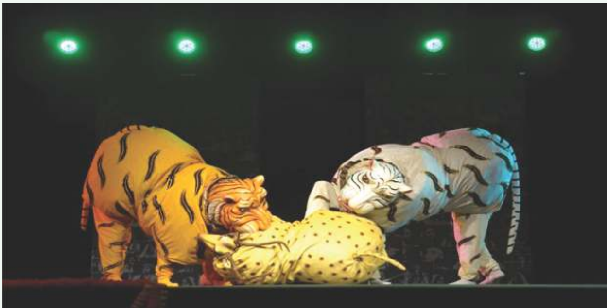
(Photograph – Bal Sangam 2019)