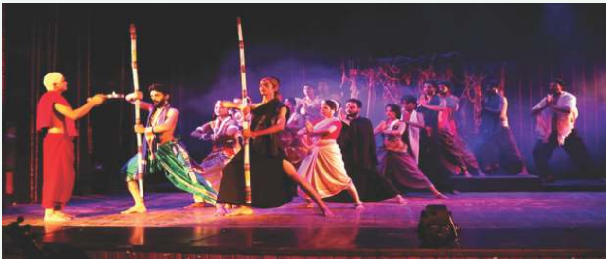
(Photograph of play Bhagwadajjukam)