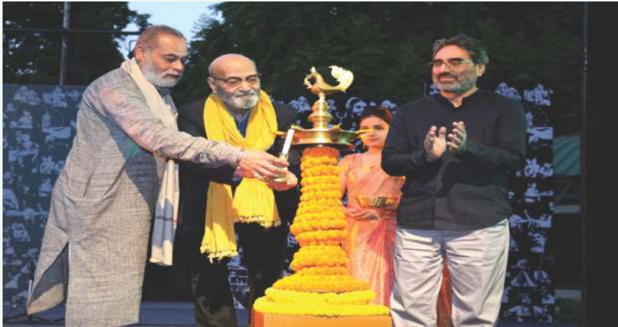
(Inauguration Photograph of Bal Sangam 2019)

event called “Bal Sangam” This is a festival with a focus on the Indian performing folk and traditional performing arts presented by children from different regions of the country. Bal Sangam has been a unique experiment and held in the shape of participating mela for children/ parents of Delhi. Through this effort, effort, children are encouraged to remain in touch with rich and varied cultural heritage of this of this county, It is also an effort to preserve and nurture the traditional arts.