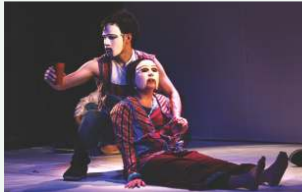
(Photograph of play ‘Kalo Sunakhari’)