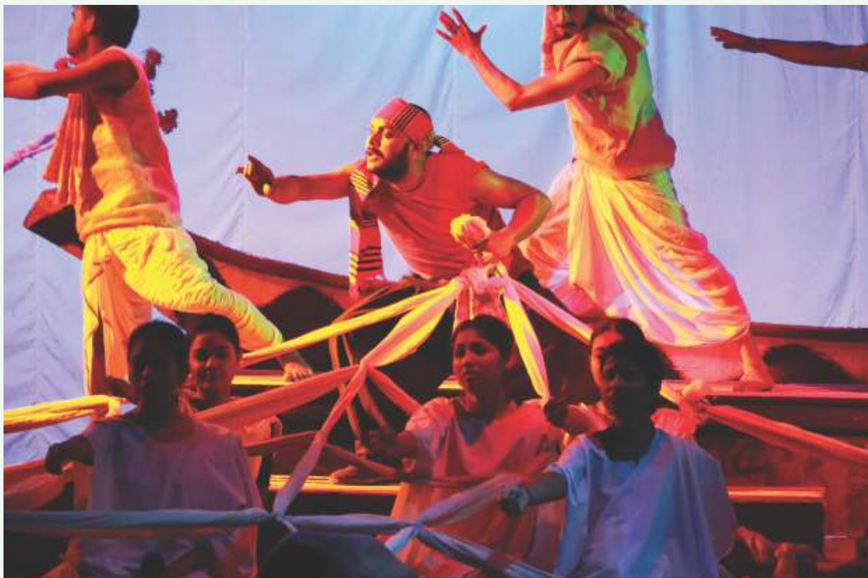
(Photograph from Pragjyotish Festival)

Every year, NSD organizes the North East Festival (Poorvottar Natya Samaroh) in North East Region. This year NSD organized this Festival as Prajyotish Festival in Guwahati (Assam), Agartala (Tripura) & Itanagar (Arunachal Pradesh) from 27th Feb. to 7th March 2020. 5 plays were showcased in each states of North East Region in Pragjyotish Festival. Around 400 artists participated in this festival. The festival was highly appreciated by the audience.