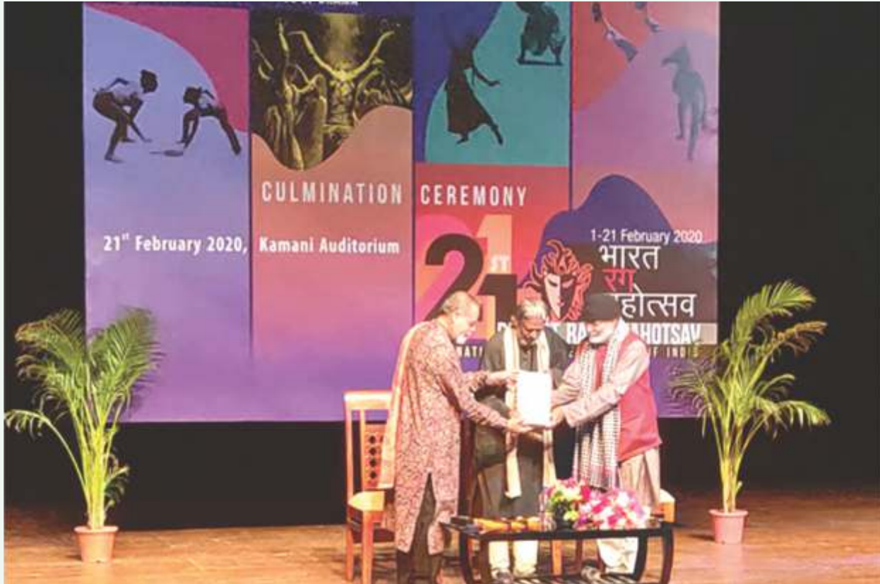
(On the occasion of Closing Ceremony of 21st Bharat Rang Mahotsav)