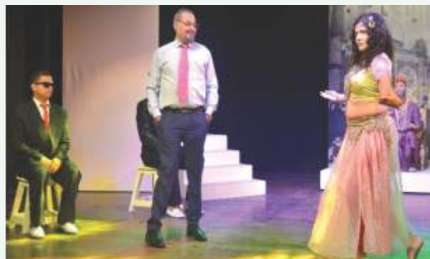
(Photograph from Tajmahal Ka Tender)