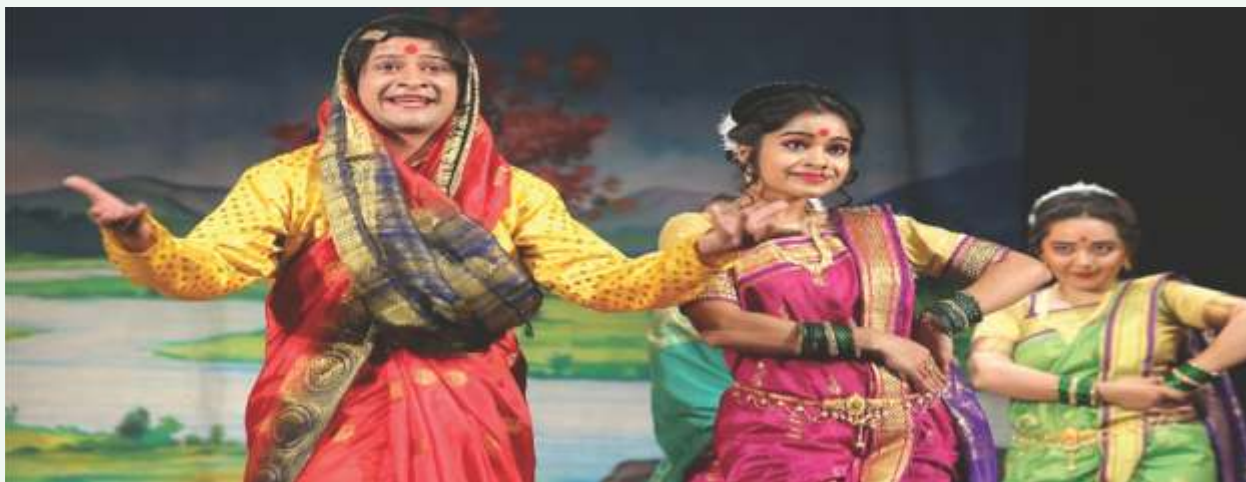
(Photograph from Khel Kursi Ka)