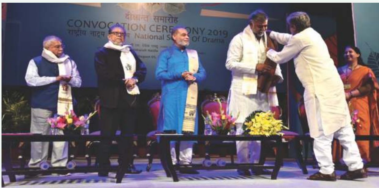
(On the occasion of convocation ceremony)