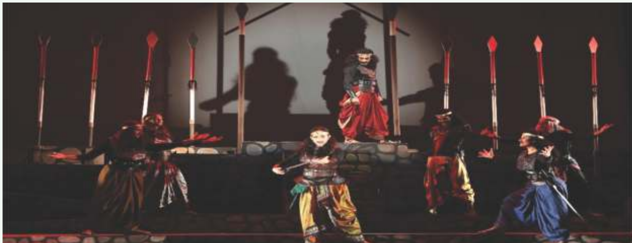
(Photograph from Veer Abhimanyu)