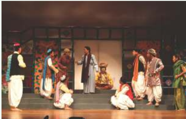
(Photograph of play ‘Hami Nai Afai Aaf’)