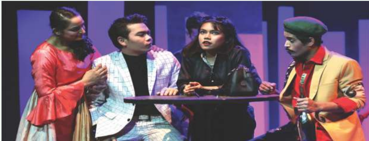
(Photograph from As Bees in Honey Drown)