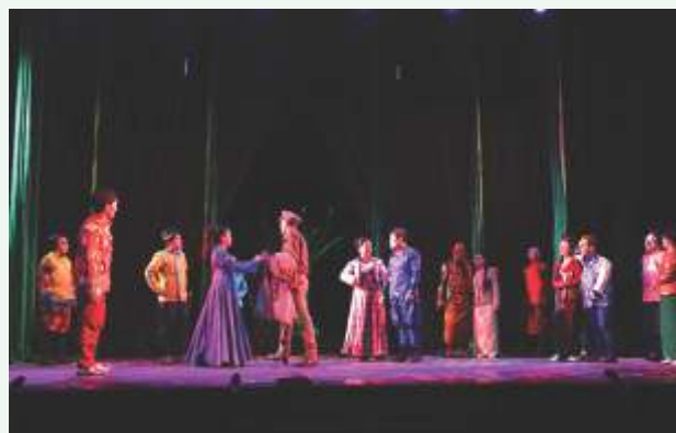
(Photograph of play ‘Ab Aur Nahi....’)