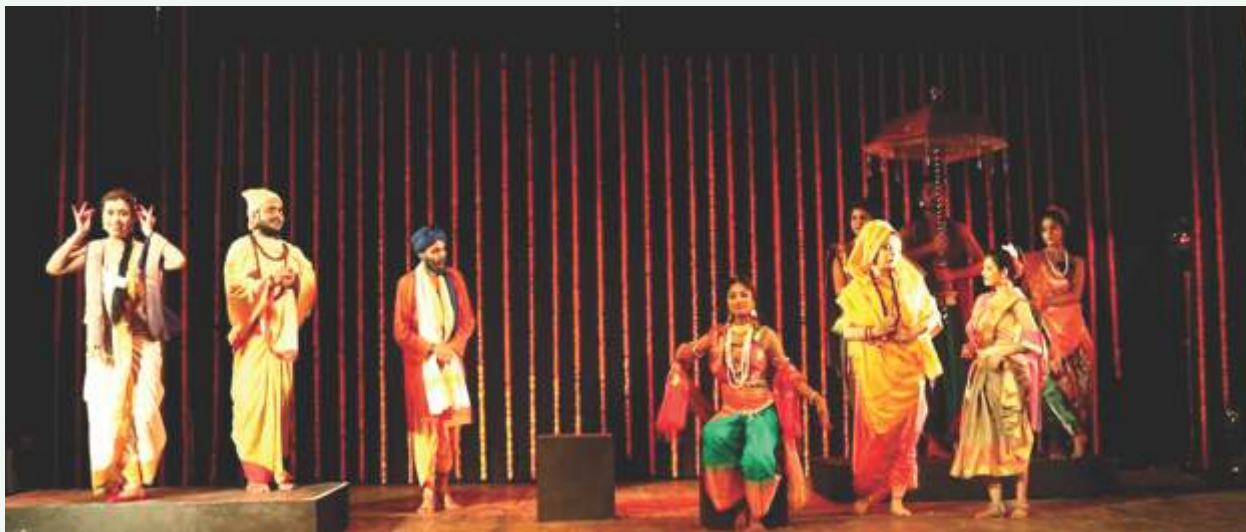
(Photograph of play Svapnavasavadattam)