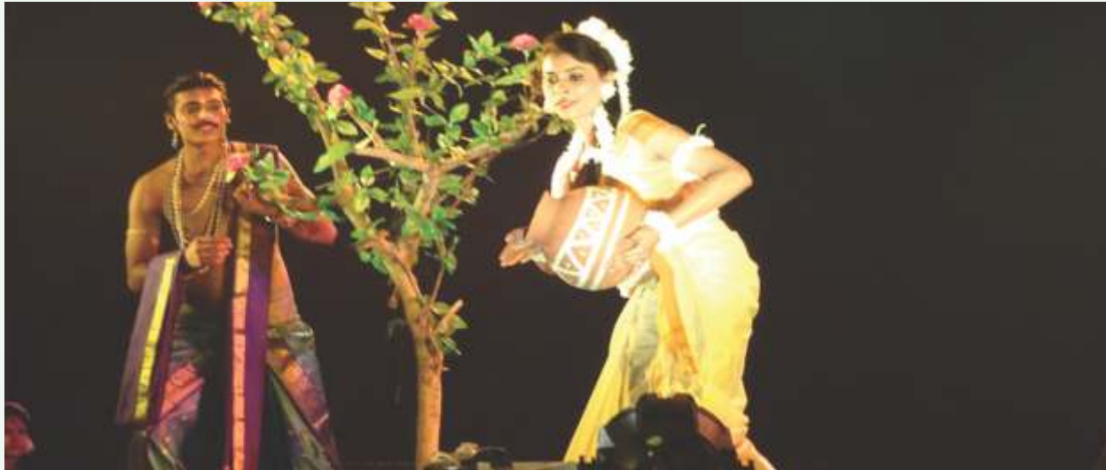
(Photograph of play Abhijjan Shakuntalam)