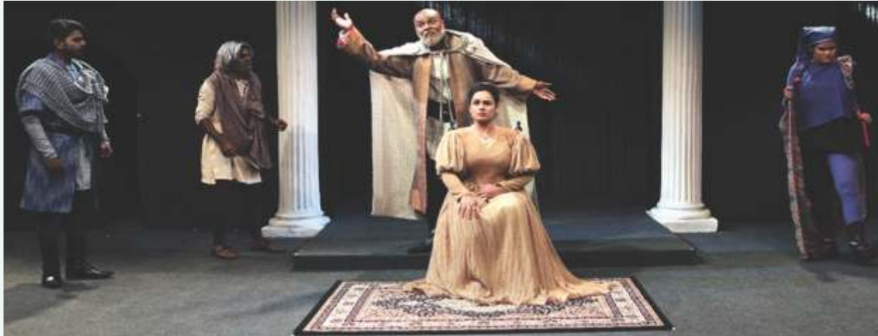
(Photograph from King Lear)

thinking that his real son, Edgar is plotting against him. Both powerful men are humbled by their realization that they were deceived. By the end of the play, both Lear and the Earl of Gloucester have learned the hard Way who is faith full to them in acts of poetic justice. Goneril and Regan are deceived by Edmund, Goneril kills Regan then commits suicide, and Edgar kills Edmund. Cordelia is hanged by Edgar's decree, and Lear dies of sorrow. Nevertheless, order is restored in the kingdom.