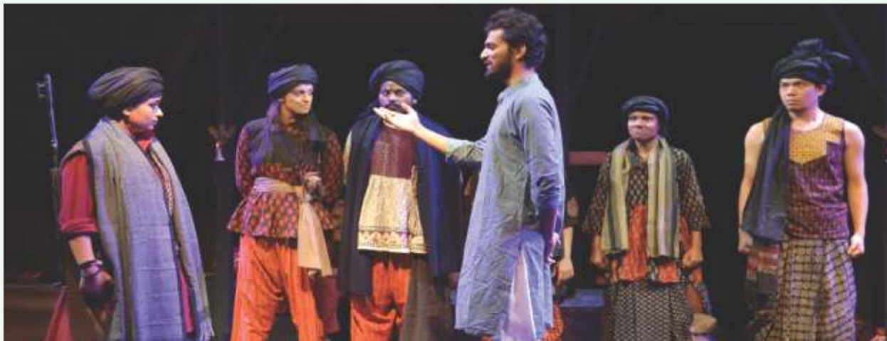
(Photograph from Paancha No Vesh)

again Pancha forms an army and the general who killed Bhairji is defeated. Pancha becomes new President. Pancha tries to run a Government for farmers and poor people. People are happy with his rule. However, Pancha is not happy being a President. He gives power to the people and once again, retires himself to the village. And while going away from the power, he warns that if the rulers will not care for the farmers and poor once, he will come back and dethrone them.