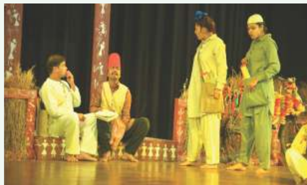
(Photograph during Summer Workshop)