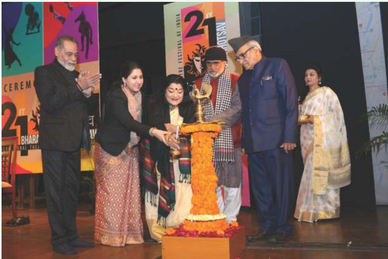
(Inauguration of 21st Bharat Rang Mahotsav)

The National School of Drama laid the foundation for the International Theatre festival of India also known as Bharat Rang Mahotsav, two decades ago with a vision of stimulating the growth and development of theatre all over the country. Initially being a national – level theatre festival, comprising the works of the most talented and creative theatre workers, the scope has expanded over the years and covers the whole globe with theatre companies from all over the world participating in this event. The first Bharat Rang Mahotsav was organized in 1999.