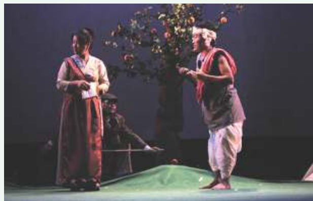
(Photograph of play ‘Suntala Ka Bagaan’)