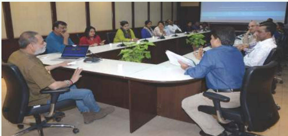
(Scenes from Organisation of Central Vigilance Awareness Week )