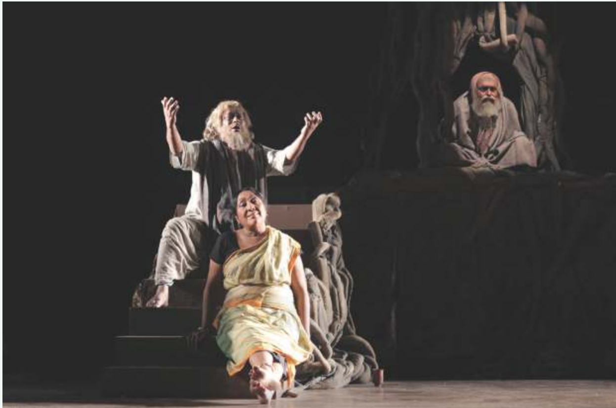
(Scene of BRM festival)

Bharat Rang Mahotsav, an International Theatre Festival, organized by NSD for the period between 1st to 21st February, 2020 is a part of the academic training activity, and therefore, 1st, 2nd & 3rd year students were given assignments based on research project on the plays/productions showcased in these 21 days International Theatre Festival.