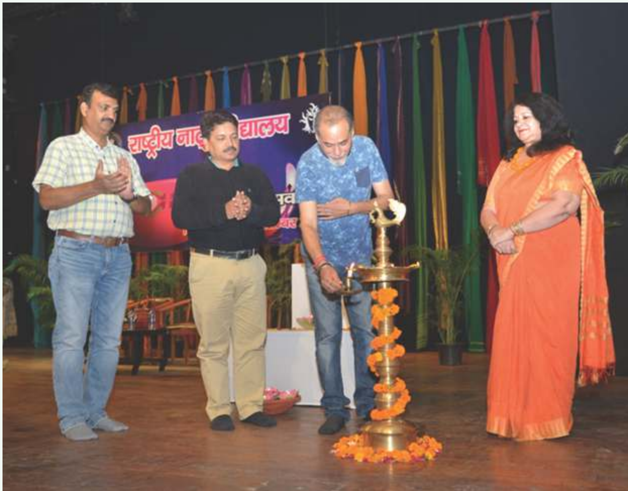
(Inauguration of Hindi Utsav 2019)

To encourage participants & to create a Competitive environment all the above competitions were followed by rewards i.e, First Second, Third and Fourth of Rs. 3100/-, 2500/-, 2100/-, 1500/- respectively.