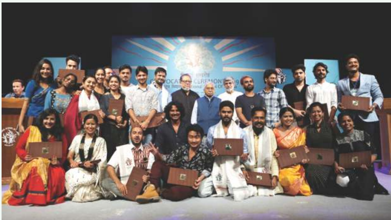
(On the occasion of Convocation Ceremony)