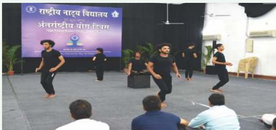
Scenes for Yoga Day