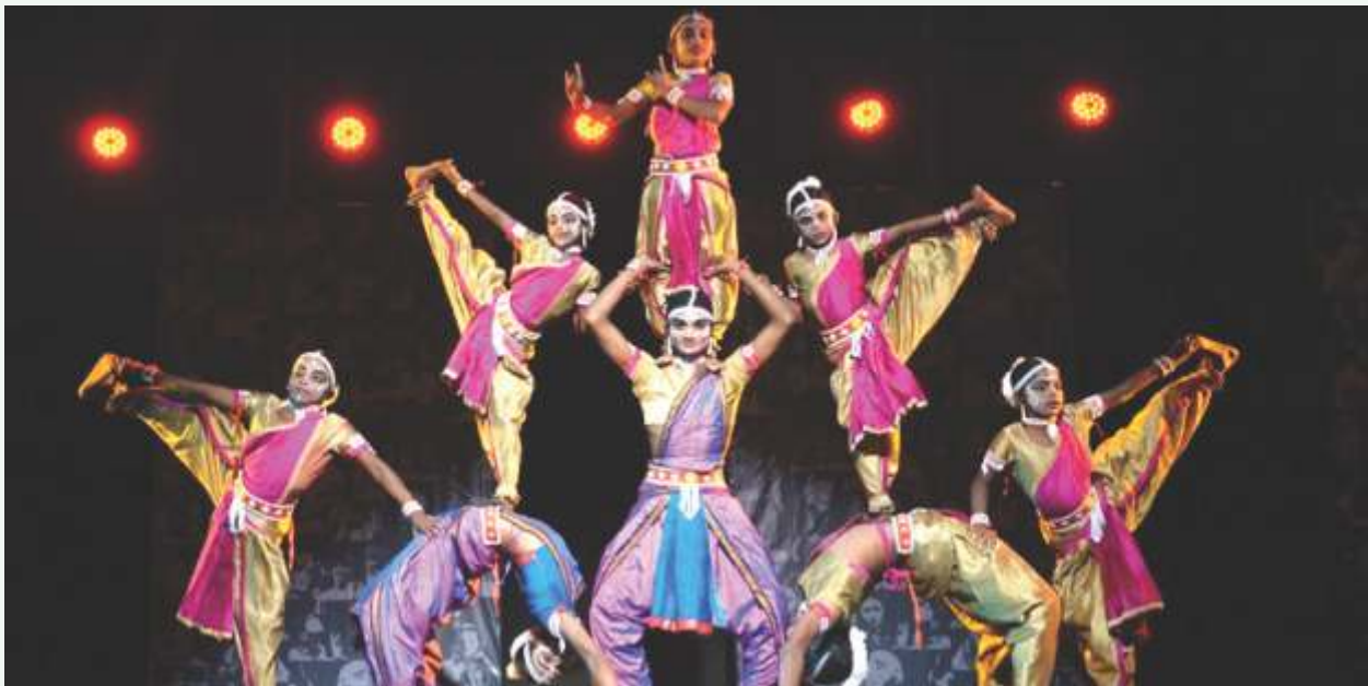
(on the occasion of Bal Sangam 2019)