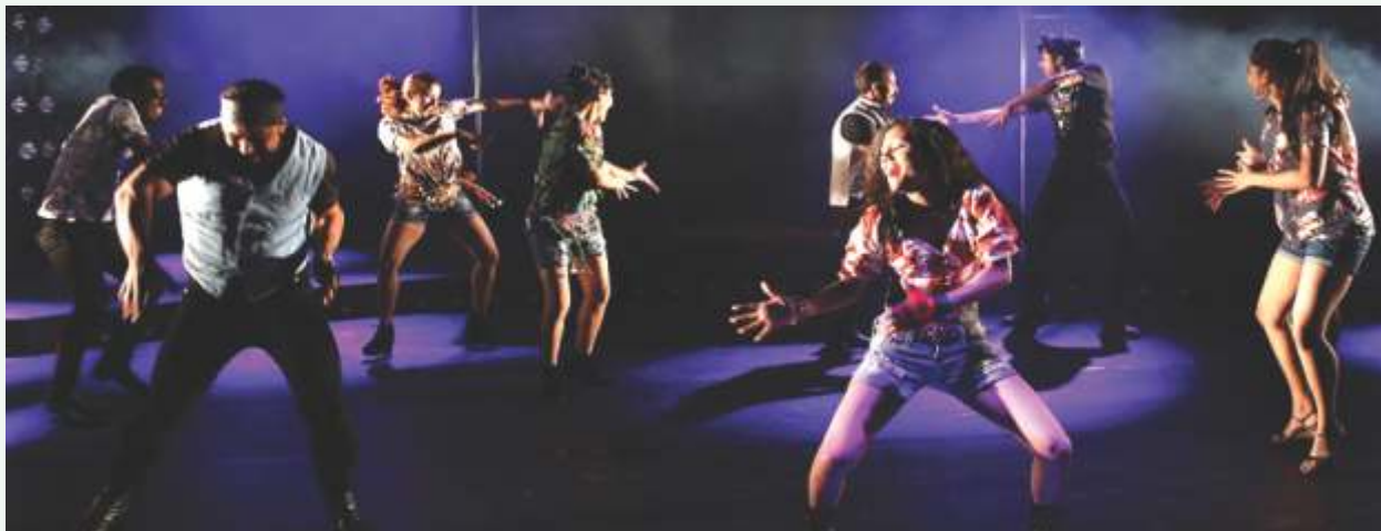
(Photograph from Romeo & Juliet)

Juliet's parents told her she must marry Paris. Her parents do not know she is already married. She refuses in the beginning, but later agrees because she plans to fake her death and escape to be with Romeo forever again, with the help of friar Lawrence. Friar Lawrence designs the plan. He gives Juliet a sleeping potion. She appears to be dead and was put in a tomb. However, Romeo does not know about the plan, visits her grave thinks she is dead, and kills himself. When Juliet finally wakes up, she discovers that Romeo is dead and then kills herself.