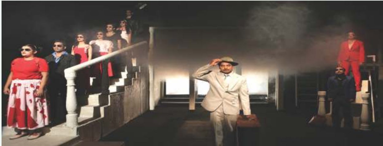
(Photograph from Katzelmacher)