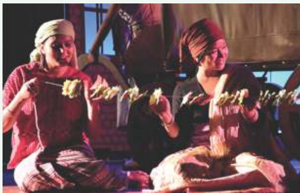
(Photograph of play ‘Sahasi Aamala’)